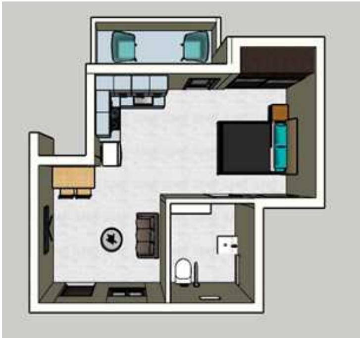
Figure 3.3D floor plan