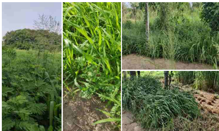
a. Guinea grass in Desmanthus field b. Germination of guinea grass from soil bank c. Inflorescence with prolific seeds d. Establishment on roadsides and field bunds

The viability of seeds has been increased under sub-freezing temperatures. The study by Clarence (1986) indicates that the viability and longevity of most of the grasses are not altered and germinate well even when continuously exposed to freezing and sub-freezing temperatures, hence leading to persistence in the soil bank.